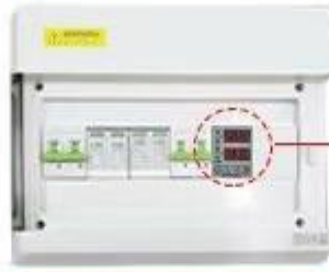
Household distribution box